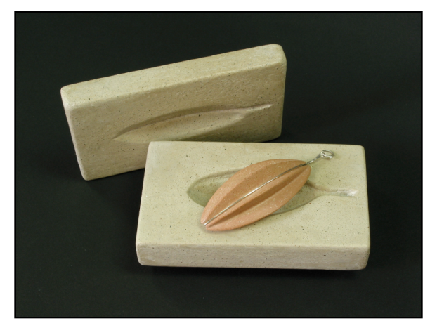
Pendant with its own concrete container. (Not for sale.)

Three-groove concrete pendants, both with sterling chains (24"). Large is about 2 1/2" long, small is about 1 7/8". One has a red pigment added to the white Portland cement. The chain goes through a loop attached to a silver strip which runs down the back. A silver wire holds the concrete in place against the strip. I have done these in colours ranging from white through black, and also with silver filings added to the mix. Price range is about $200 to $250 (box not included).