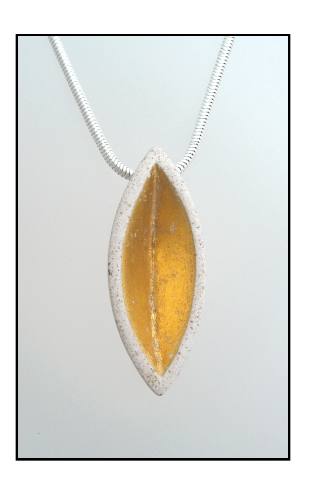
Small variation, 1 3/4", $175.

Concrete pendants, two with gold leaf, all with sterling chains (24"). Each is about 2 3/4" long, and about 1/2" thick. The chain goes through a drilled hole in the concrete. I do these with a smooth concave surface (left), or a V-groove like a boat (center and right). $200 each.